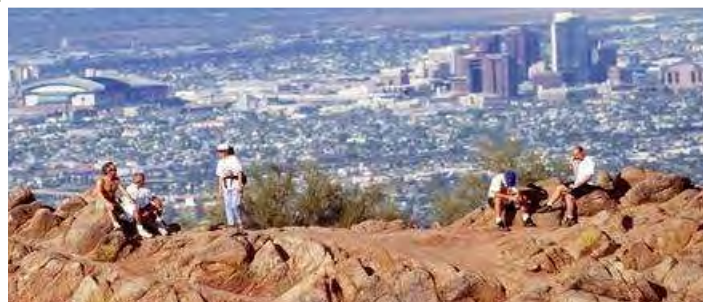
Above: Downtown Phoenix viewed from South Mountain. Upper Right: Phoenix is a valley surrounded by mountains. Right: Visitors may tour the 8,000 sq. ft. Mystery Mansion built into the base of South Mountain.