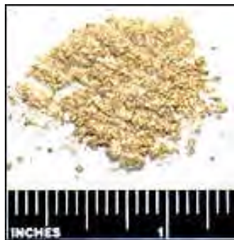
“Cheese”, a potentially lethal drug mixture of heroin and Tylenol PM, usually snorted and inexpensive to obtain is appealing to teens.

mixture and using less heroin, they are actually trading a decrease in the respiratory depressant effects of the heroin for a potentiation of the cardiotoxicity.