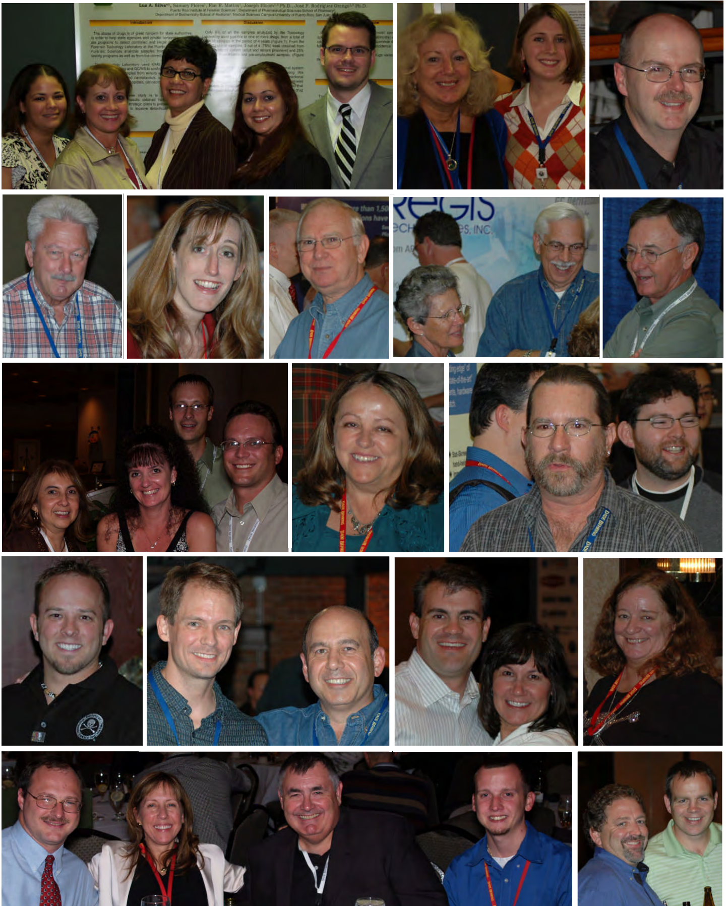
Grateful thanks to both Tinsley Preston, III, and H. Chip Walls for supplying this wonderful selection of photographs!