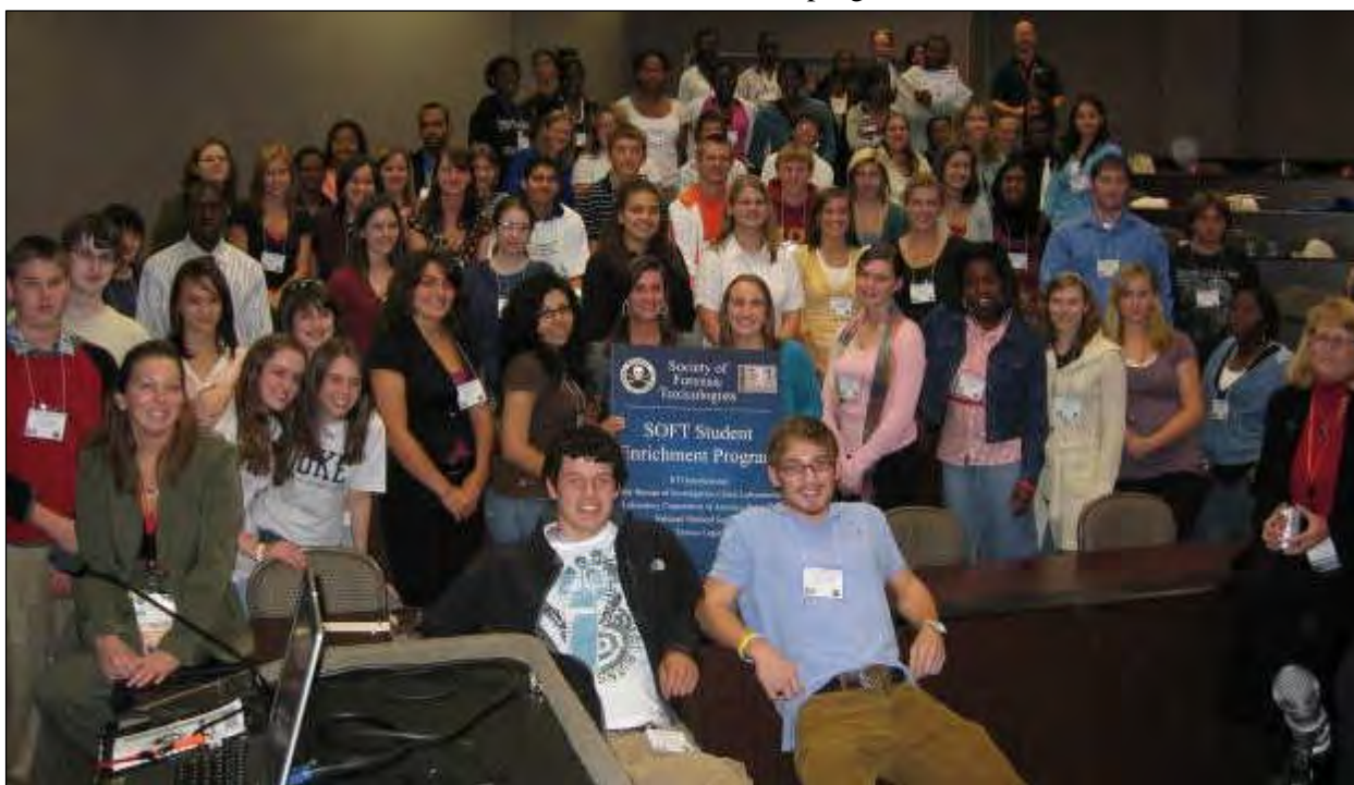
Students and Faculty of the Inaugural SOFT Student Enrichment Program held October 15, 2007 in Raleigh, NC.

with the reactions, impressions and suggestions we received regarding the SOFT-SEP. We are hopeful that the program will be continued as a regular part of SOFT's annual meeting (planning for Phoenix has already begun!), and we are confident that we have laid down a good foundation on which others may build in future years.